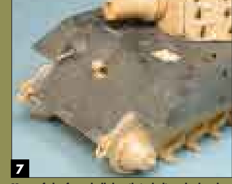
Most of the front hull detail, including the headlight, U-hooks, and machine gun also came from the Revell box.