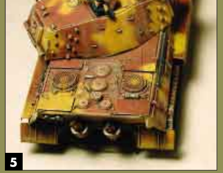
With all the bits and pieces installed, the highly detailed engine deck is a highlight of the finished model.