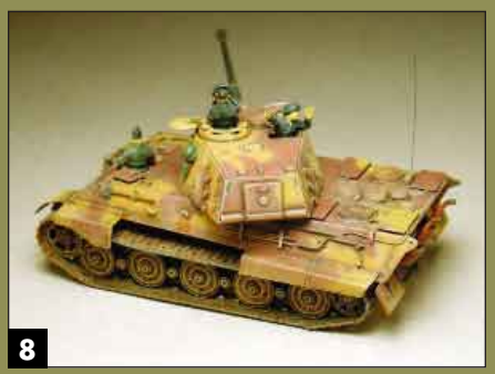
The realistically ratty fenders and side skirts came from one of the Part photoetched set.