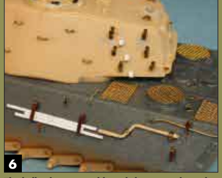
The hull sides received barrel cleaning rods made from Evergreen styrene rod held down with photoetched brass mounting brackets. The engine starter crank came from the Revell kit.